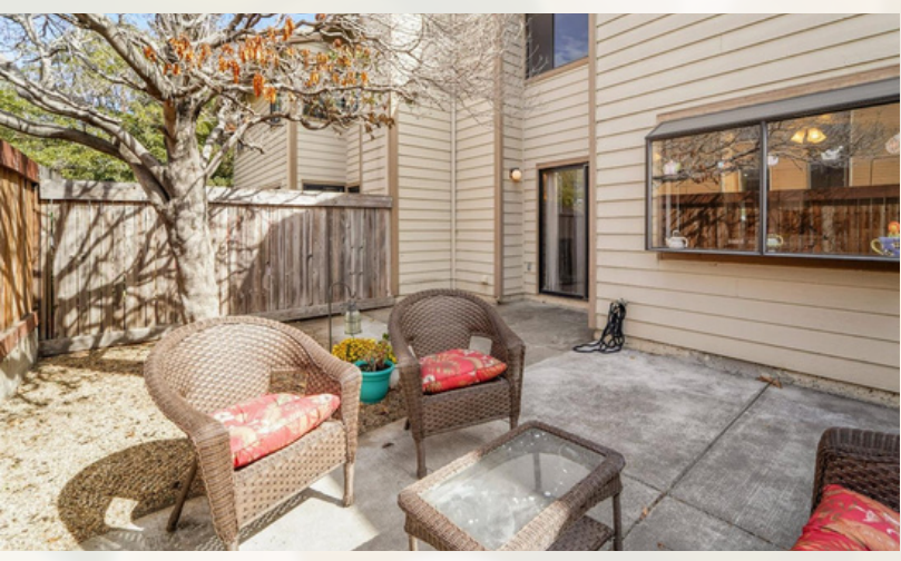
CEDAR TERRACE, SAN PABLO THIS HOME SOLD FOR 108.13% OF THE ASKING PRICE!