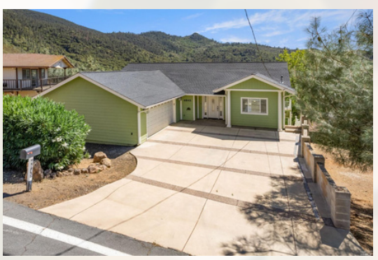
GRANDE VISTA KELSEYVILLE