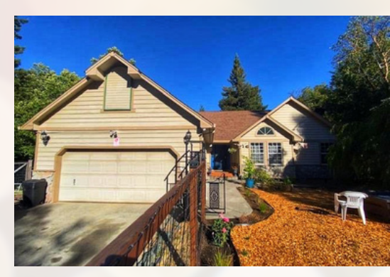
PERCH LANE WILLITS