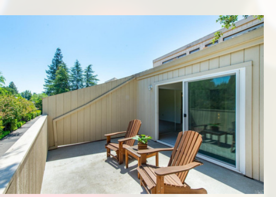
NORTH STREET HEALDSBURG

We currently have over 20,549 Buyers in our database, with more being added every day! We Had The Buyers For: