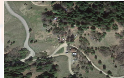
BELL SPRINGS ROAD LAYTONVILLE

FIND OUT HOW MUCH YOU CAN SELL YOUR HOME FOR CALL DREW NICOLL HOME SELLING TEAM TODAY AND START PACKING 707-500-3739