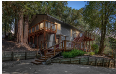
POPPY DRIVE WILLITS