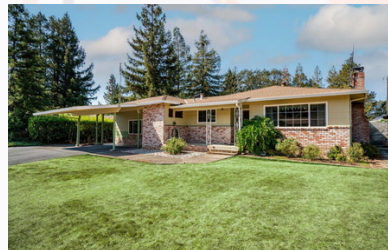
WESTERLY PLACE UKIAH