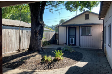
LORRAINE STREET UKIAH

We currently have over 19,424 Buyers in our database, with more being added every day! We Had The Buyers For: